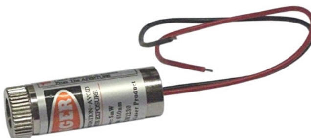
< 5mW 650nm FOCUSABLE LASER MODULE